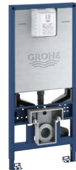
39 602 000 Rapid SLX WC 3-6 | 1.13 m US Rapid SLX Element for WC, 1.13 m installation height with flushing cistern GD2, with electric socket, including flow manager, easy access. Specifically for USA with specific settings.