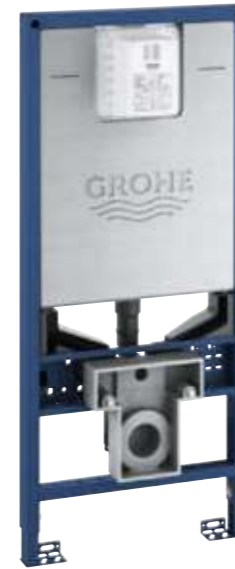
39 597 000 Rapid SLX WC 3-6 | 1.13 m, without outlet pipe Rapid SLX Element for WC, 1.13 m installation height with flushing cistern GD2, with electric socket, including flow manager, easy access and fully insulated against condensation. Without outlet pipe.

get exactly the setup you require, ultimately saving you time and money and ensuring you can deliver complete customer satisfaction from the start.