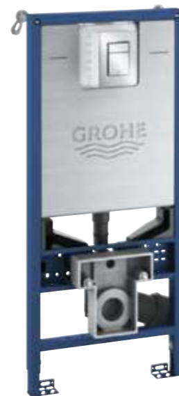
39 603 000 Rapid SLX WC 3-6 | 1.13 m with wall brackets and Skate Cosmopolitan S Chrome Rapid SLX Element for WC, 1.13 m installation height with flushing cistern GD2, with electric socket, including flow manager, easy access and fully insulated against condensation. With wall brackets and Skate Cosmopolitan S (chrome) flush plate.