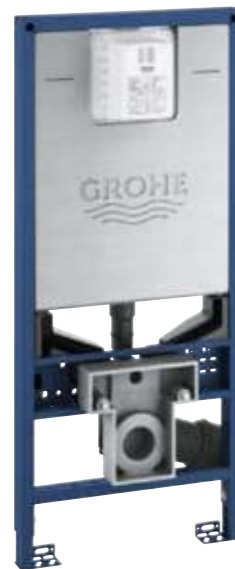
39 596 000 Rapid SLX WC 3-6 | 1.13 m, Standard Rapid SLX Element for WC, 1.13 m installation height with flushing cistern GD2, with electric socket, including flow manager, easy access and fully insulated against condensation.