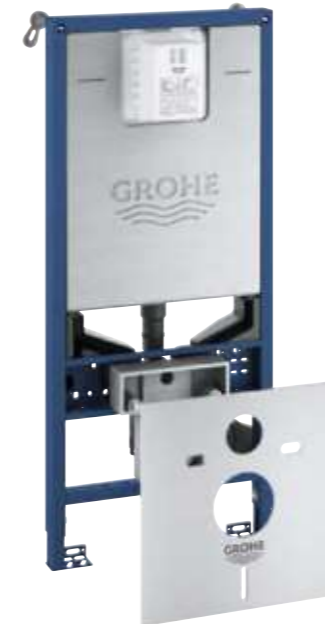
39 598 000 Rapid SLX 3in1 WC 6 | 1.13 m with wall brackets and noise protection Rapid SLX Element for WC, 1.13 m installation height with flushing cistern GD2, with electric socket, including flow manager, easy access and fully insulated against condensation. With wall brackets and noise protection.