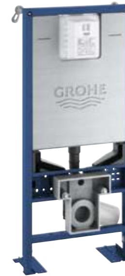
39 599 000 Rapid SLX WC 3-6 | 1.13 m F with heavy load feet Rapid SLX Element for WC, 1.13 m installation height with flushing cistern GD2, with electric socket, including flow manager, easy access and fully insulated against condensation. With heavy load feet.