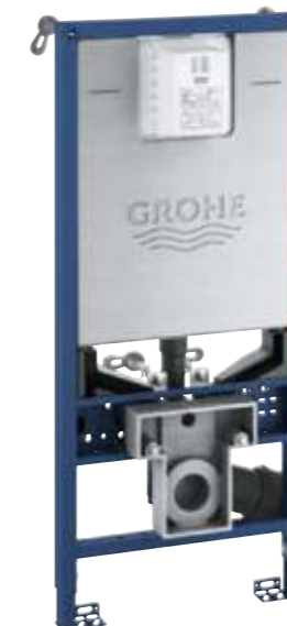
39 600 000 Rapid SLX WC 3-9 | 1.13 m SC Nordics adapter Rapid SLX Element for WC, 1.13 m installation height with flushing cistern GD2, with electric socket, including flow manager, easy access. Including pipe-in-pipe connection.