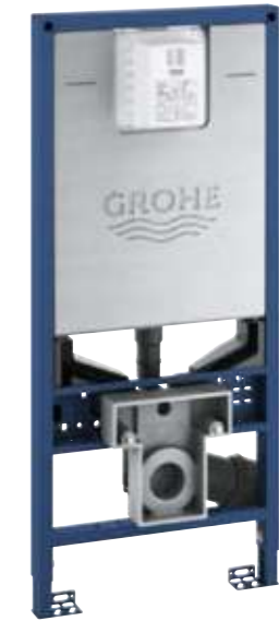
39 601 000 Rapid SLX WC 3-6 | 1.13 m, SASO Rapid SLX Element for WC, 1.13 m installation height with flushing cistern GD2, with electric socket, including flow manager, easy access. Specifically for Saudi Arabia with different settings.