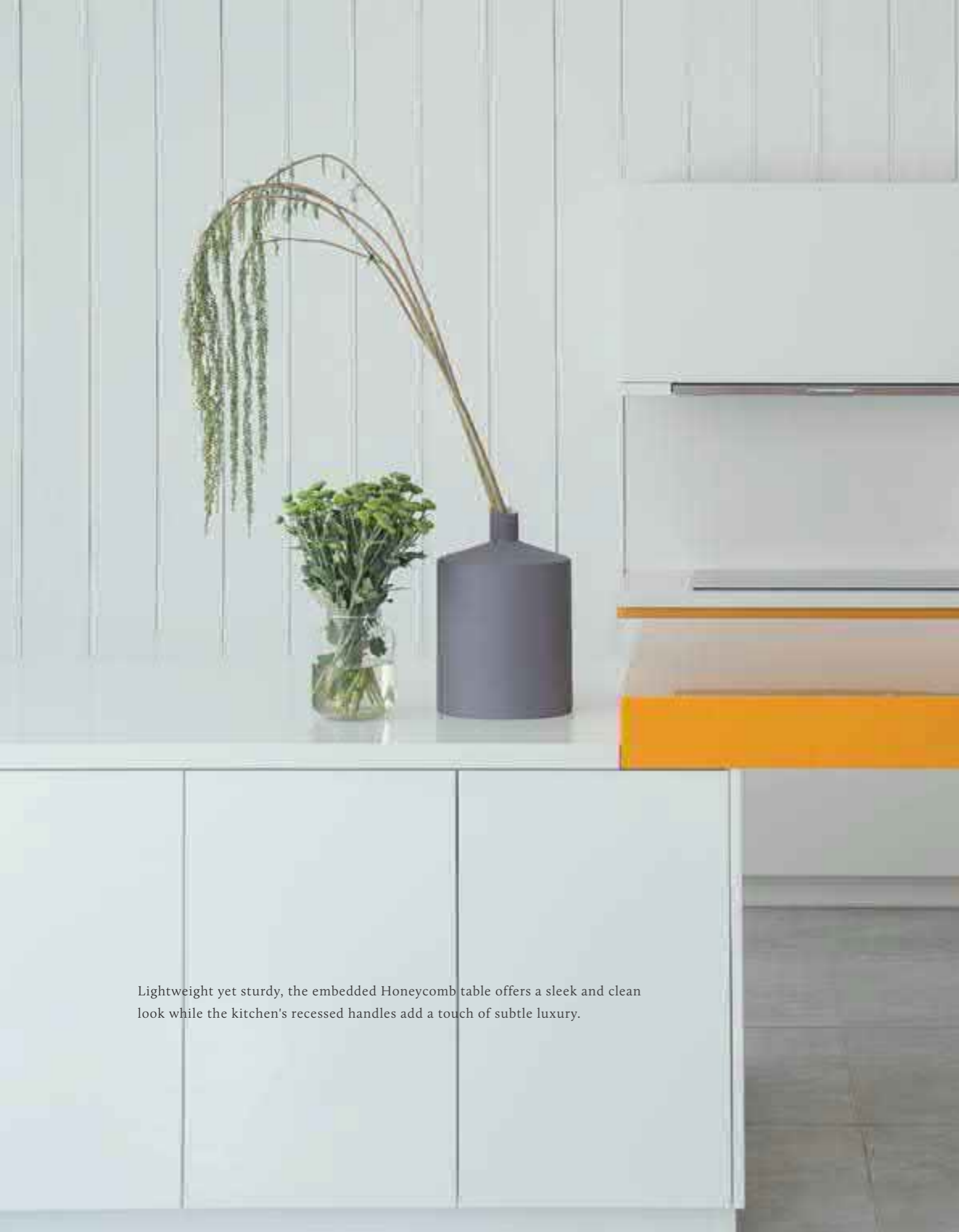
Lightweight yet sturdy, the embedded Honeycomb table offers a sleek and clean look while the kitchen's recessed handles add a touch of subtle luxury.