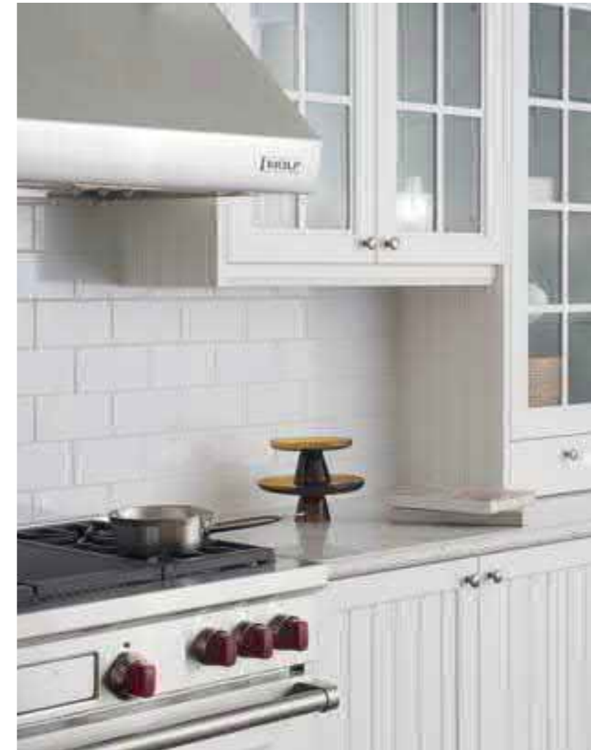
Our Country Style Kitchen delivers a rustic feel with modern sensibilities. Its Matt Lacquer finish conveys a sense of refinement for the bold and romantic at heart.