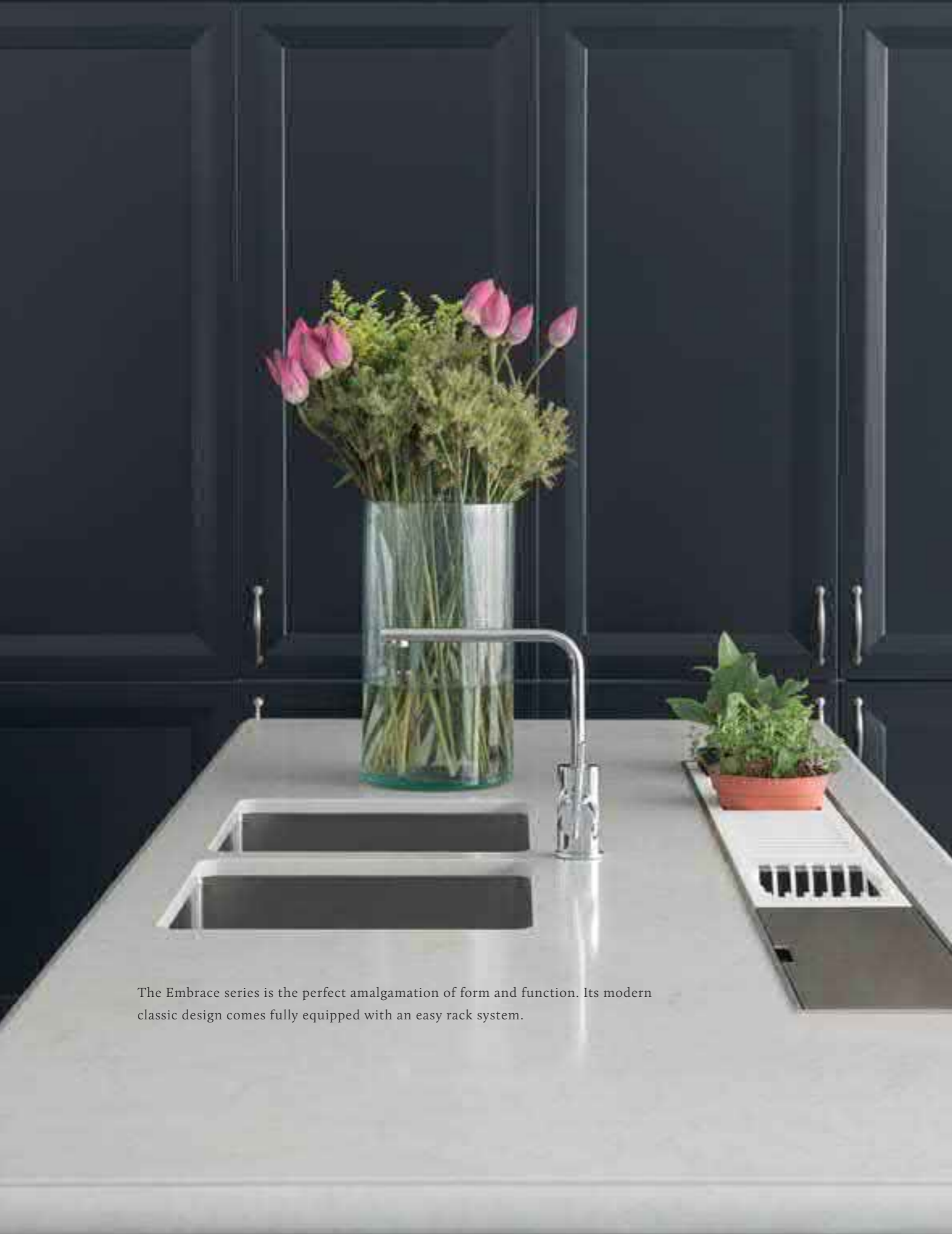
The Embrace series is the perfect amalgamation of form and function. Its modern classic design comes fully equipped with an easy rack system.