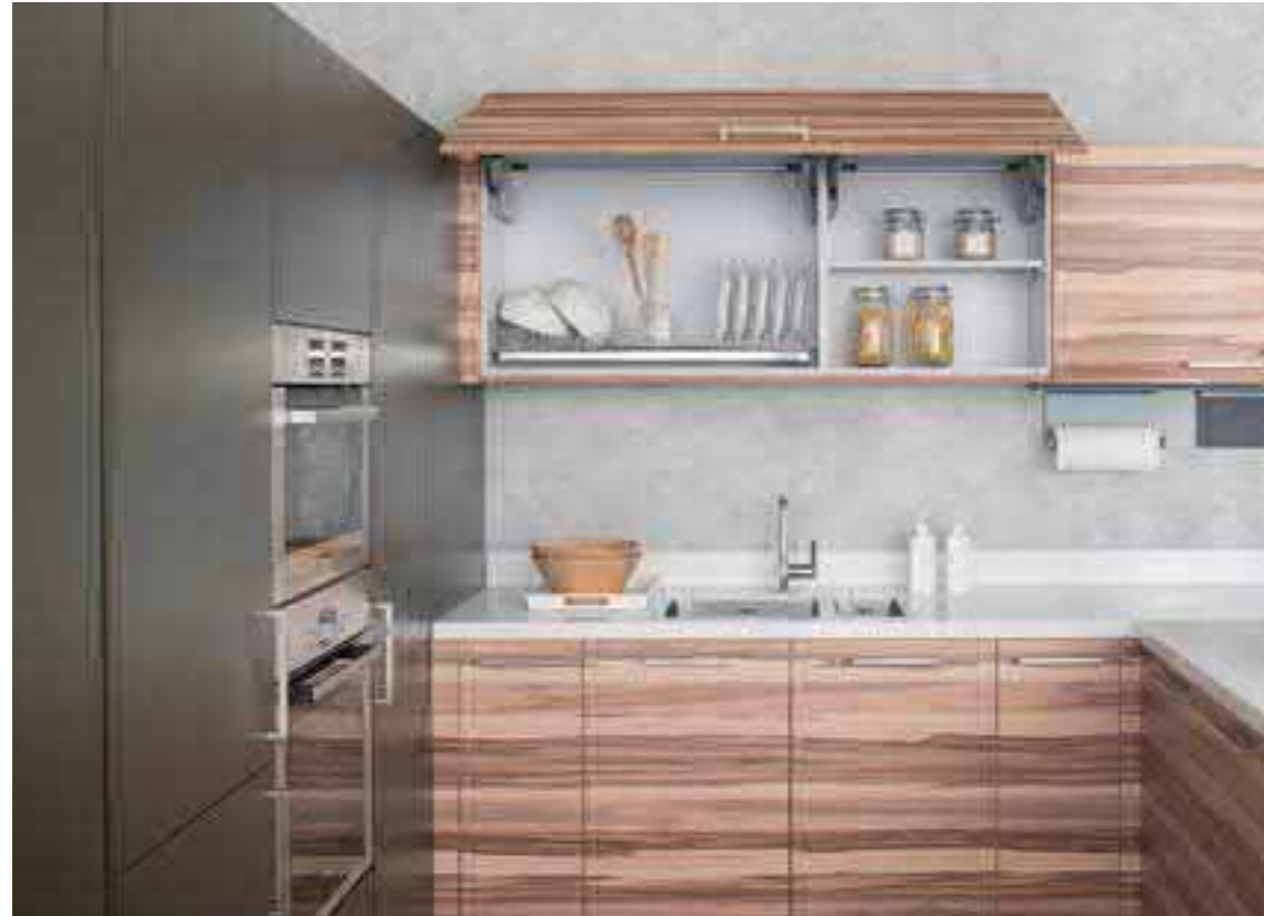
The ultimate manifestation of an unadulterated beauty, the MFC Kitchen Series features a beautiful wood grain texture that runs from one end to the other end.