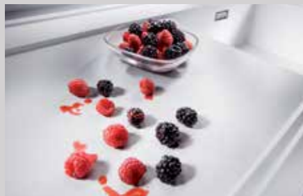
Lasting impression – not even heavily staining foods such as fruit, marks the material.

Never before has a sink centre been so easy to clean.