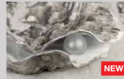
Pearl grey – a colour that is like one of nature's treasures.