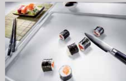
Stays always neutral – SILGRANIT™ PuraDur™ is 100% food safe