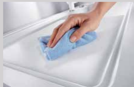
Easy work – SILGRANIT™ PuraDur™ is clean in moments