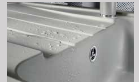
Colouring that touches us deeply and goes deeper. SILGRANIT™ PuraDur™ is solid dyed.