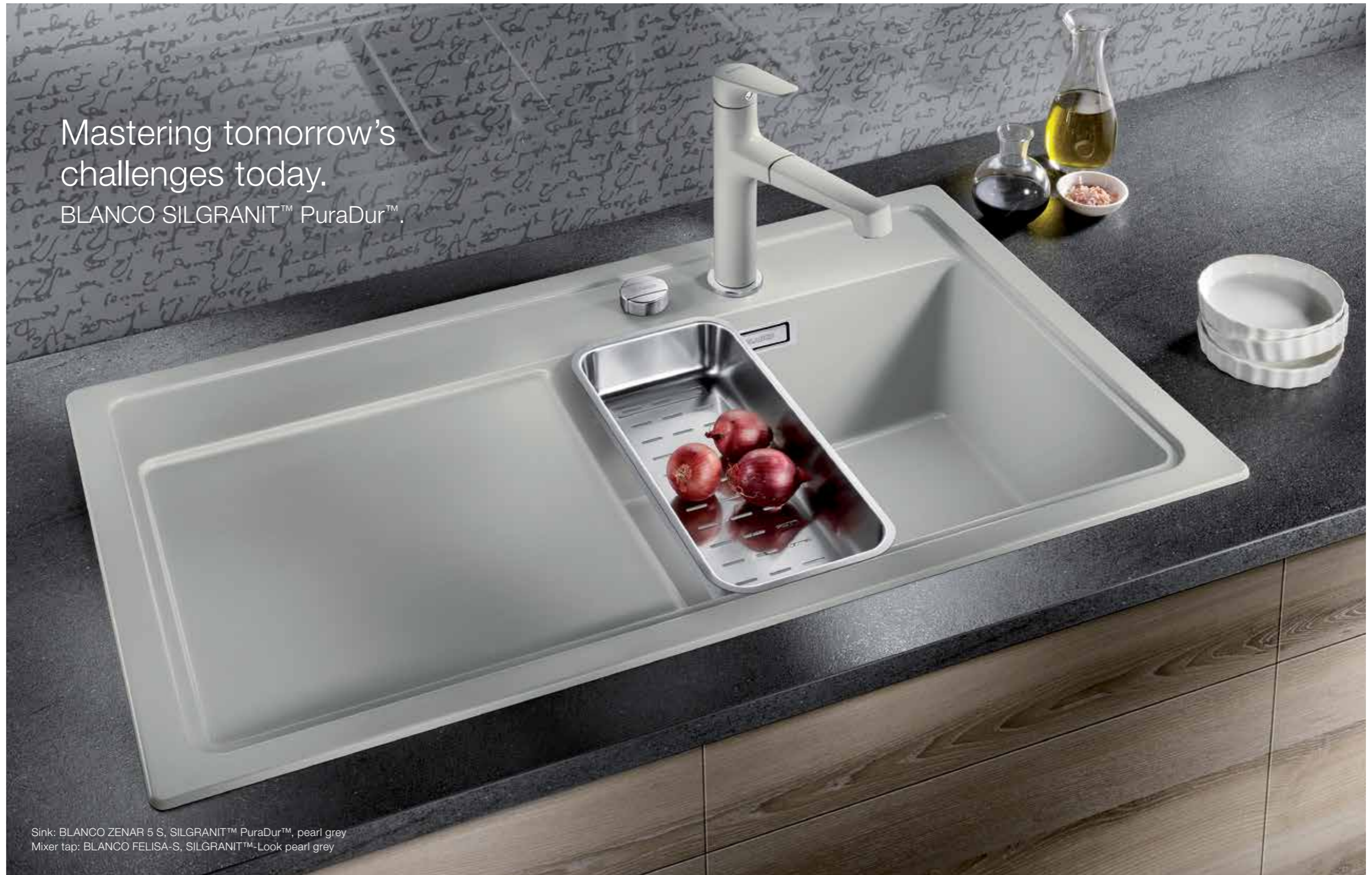
Sink: BLANCO ZENAR 5 S, SILGRANIT™ PuraDur™, pearl grey Mixer tap: BLANCO FELISA-S, SILGRANIT™-Look pearl grey

SILGRANIT™ PuraDur™ can cope with any of the challenges presented by modern daily life in the kitchen.