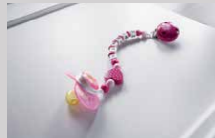
A safe thing – hygiene is child's play thanks to Hygiene+Plus.