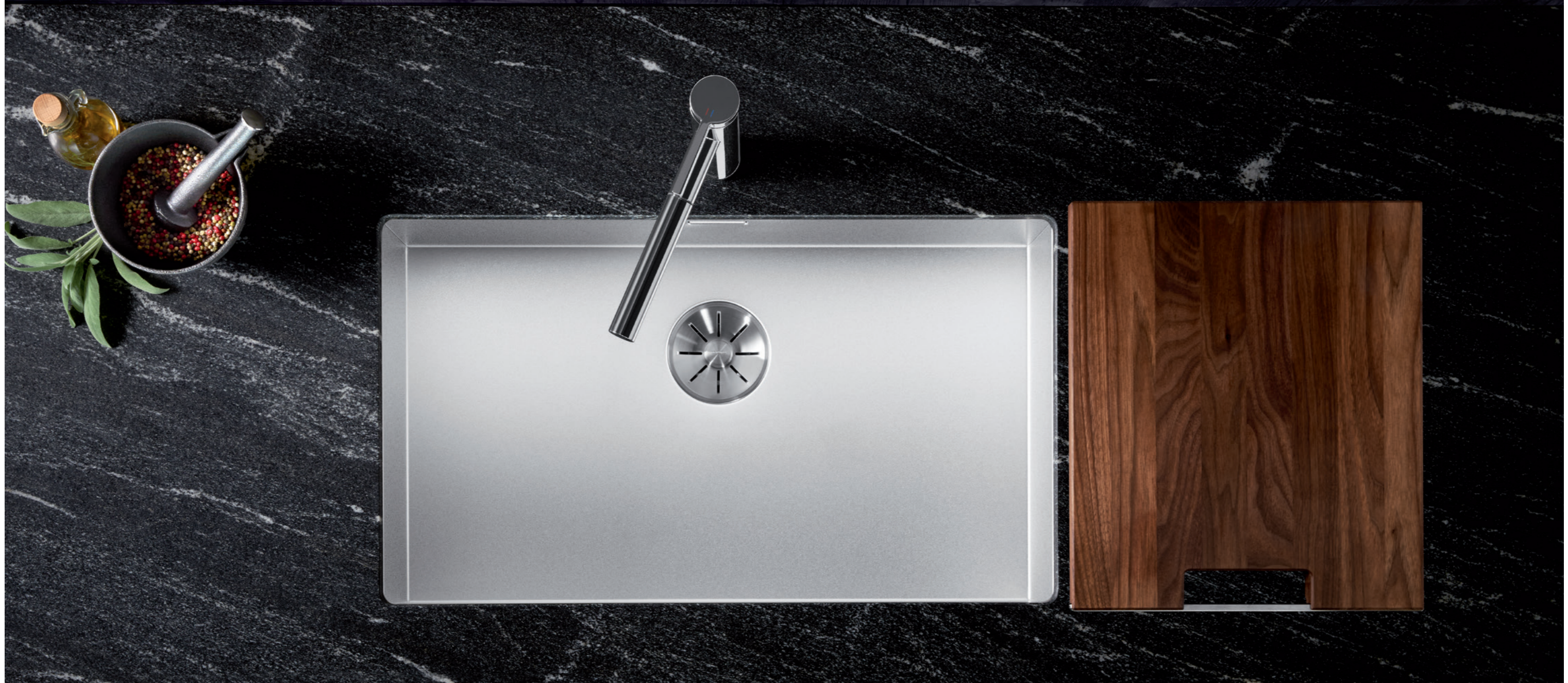
Above: BLANCO ZEROX undermount bowl with the Durinox™ finish

Stainless steel bowls in the Durinox™ finish. Unlike anything we have ever seen before.