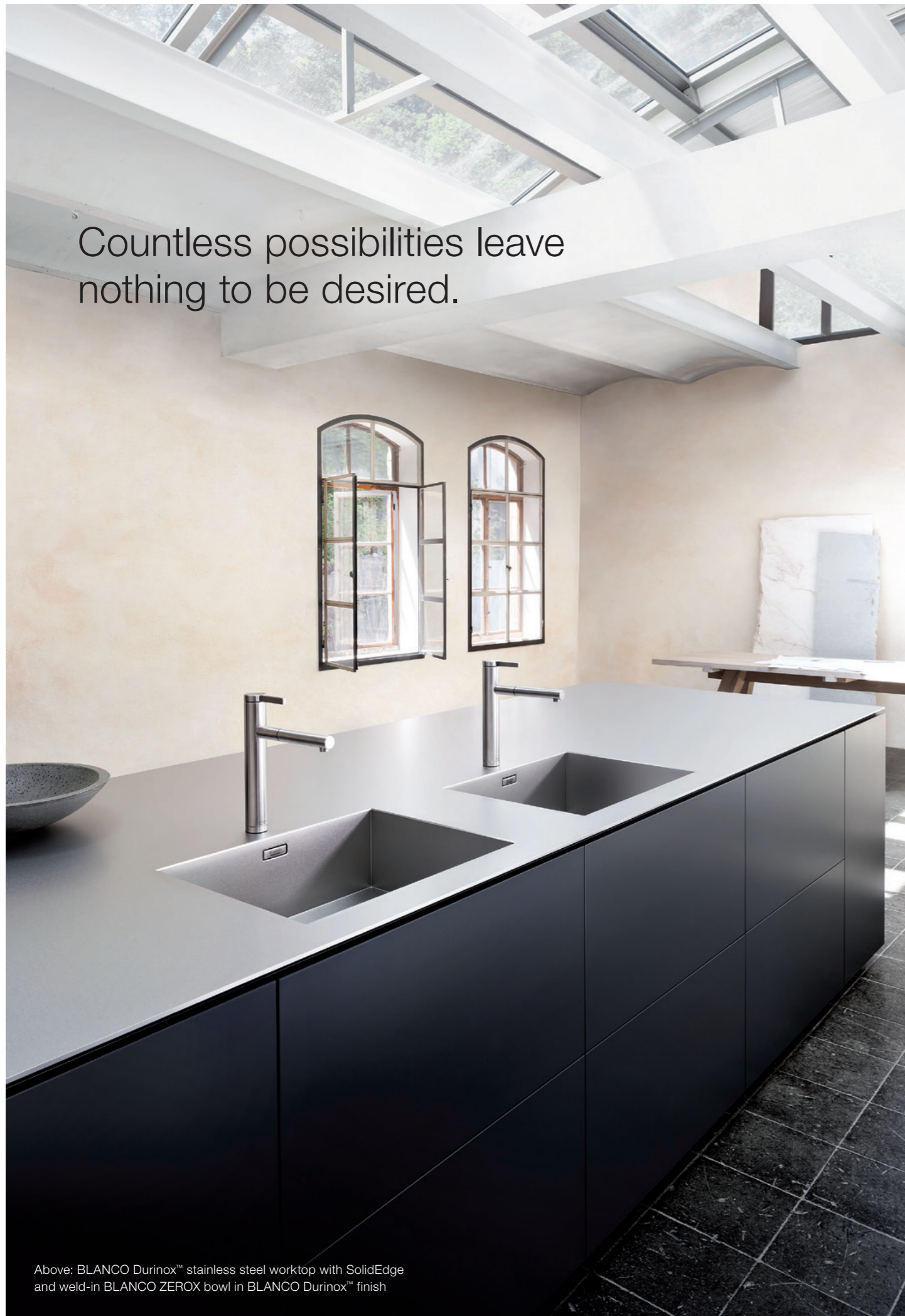
Above: BLANCO Durinox™ stainless steel worktop with SolidEdge and weld-in BLANCO ZEROX bowl in BLANCO Durinox™ finish

Countless possibilities leave nothing to be desired.