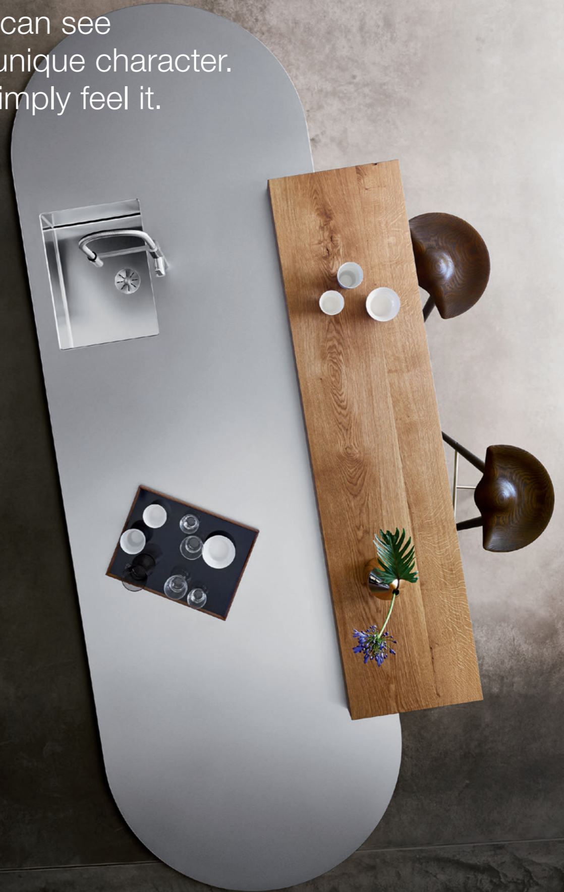
Above: BLANCO Durinox™ stainless steel worktop with weld-in BLANCO CLARON bowl in stainless steel satin polish

You can see the unique character. Or simply feel it.